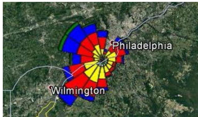
Figure 1: Wind Rose based on Philadelphia International Airport data

Meteorological data sets include ground level weather observation data and upper air profile data. Data collected in the years 2010-2014 were used. The ground level data were the Philadelphia International Airport data sets; the concurrent upper air data were from the Sterling, Virginia station according to EPA air modeling protocols. Figure 1 shows the five-year wind rose based on ground level data from the Philadelphia International Airport weather station.